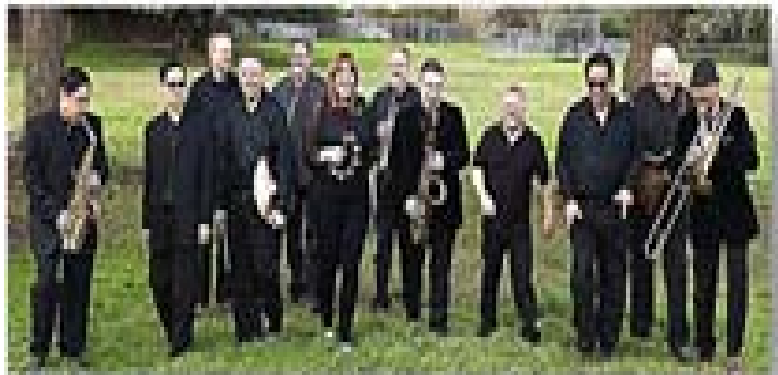
Here's what On Air looks like today.

If you want to keep up with where On Air is performing, their schedule is on their website, onairband.com . Videos of their performances are on the website too.